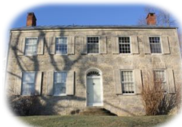
Dale-Engle-Walker House