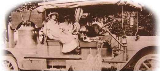
The Liberty Bell in Union County September 1915

Union County Historical Society will join the League of Women Voters in celebrating the centennial passage of the 19th Amendment. This event will include a review of Union County's reactions before and after women began voting.