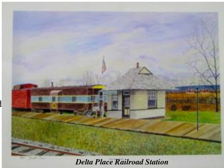
Delta Place Railroad Station