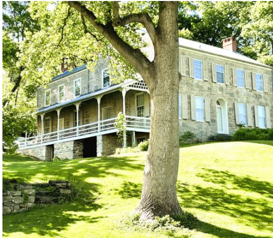
The Dale-Engle-Walker House by MM

Union County Historical Society Union County Courthouse 103 South 2nd Street Lewisburg, PA 17837 Return Service Requested