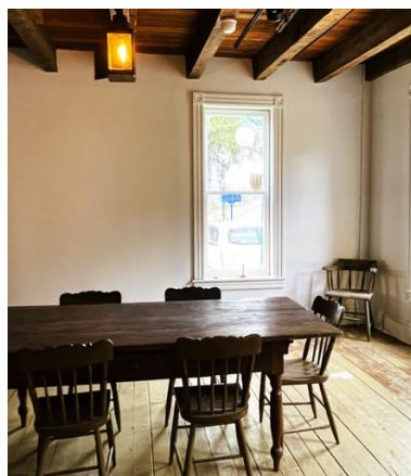
The Tavern Great Room, newly renovated, in the Museum