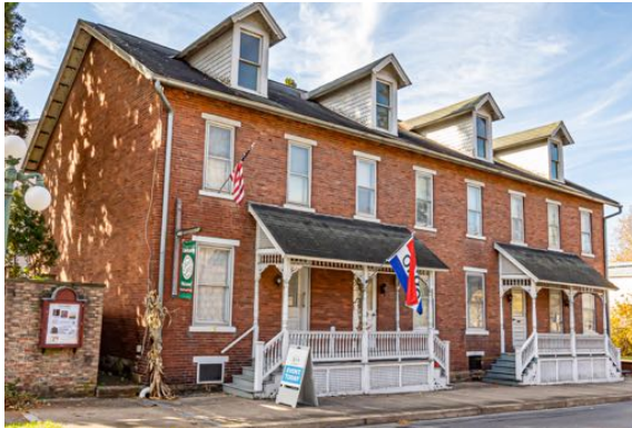
Historical Society Gallery 15 N. Water Street , Lewisburg, PA