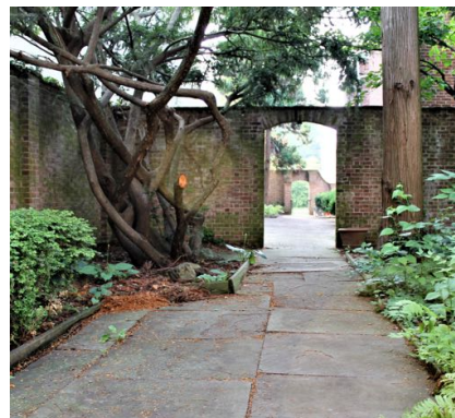
The Courtyard between the Gallery and Museum