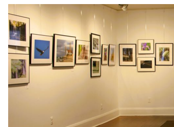
LAC Arts Exhibit in the Gallery