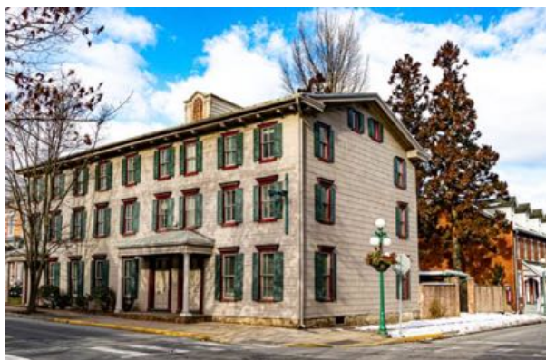
Historical Society Museum 12 Market Street. Lewisburg, PA