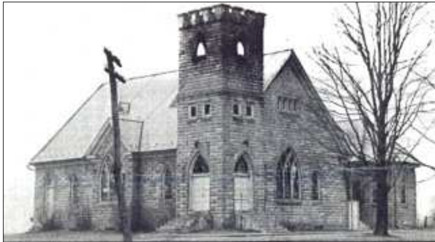
Stone church, 1938

The story of this unheralded moment in local history is vividly recounted in the critically acclaimed documentary film Surrender! The Sudden Death of Alvira, Pennsylvania , which will screen Sunday, March 30 at noon and 1:30PM at the Campus Theater in Lewisburg. The event will be a fundraiser for the Union County Historical Society.