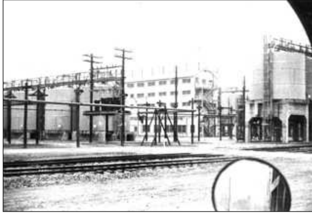
Nitric acid production plant

Making TNT required vast amounts of nitric acid. It was produced at the Pennsylvania Ordnance Works by distilling ammonia delivered to the facility in miles of tank cars that entered the facility via a rail spur from Allenwood.