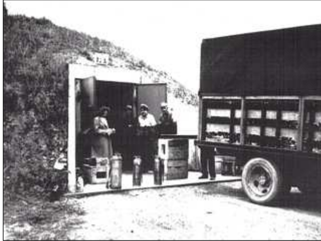
Storing TNT at 1 of 150 igloos

Storage of TNT produced was in 150 "igloos" on site. Each igloo held 250 pounds of TNT in 50-pound wooden crates, ready for rail shipment to East Coast arms manufacturers.